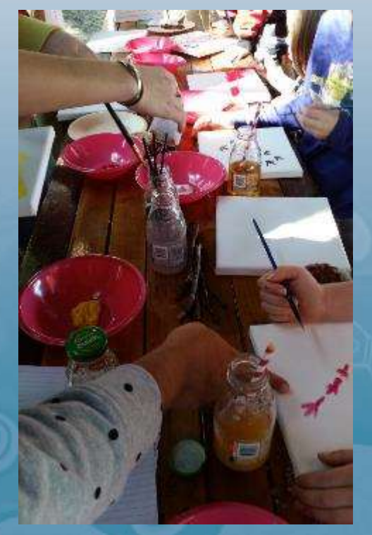
The children paint on canvas with oil paints and ochre, CERES April 2018.